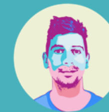
Balazs Production & Design