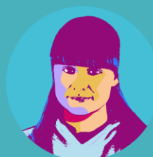
Millie Production & Sales