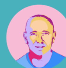
John C. Manufacturing