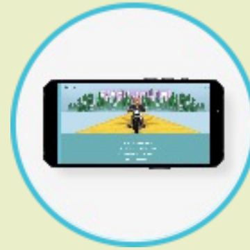
eShop & Academy