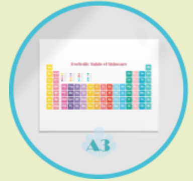
Periodic Table of Skincare