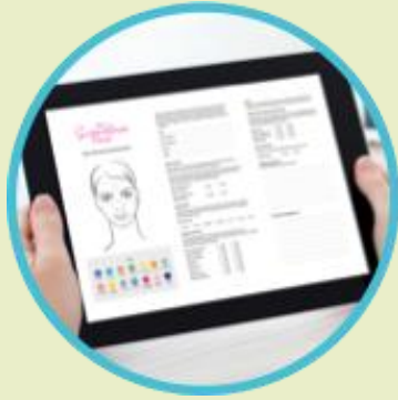
Skin Fitness Assessments