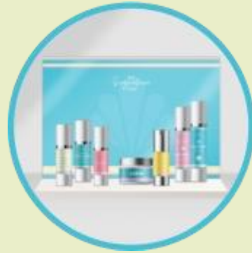
Point Of Sale Display